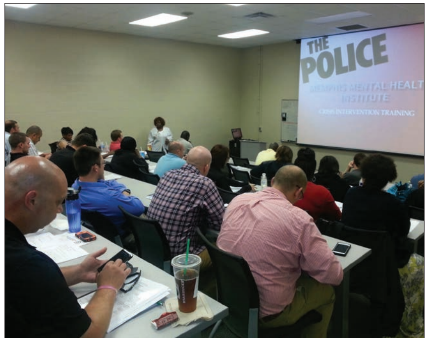
The Memphis Crisis Intervention Team receives training from Memphis Mental Health Institute employees about common types of mental illness they may encounter during a crisis situation in the field.

MMHI is excited to support the CIT officers in the area of mental health because CIT provides an immediate response to calls involving a large number of patients involved in crisis situations.