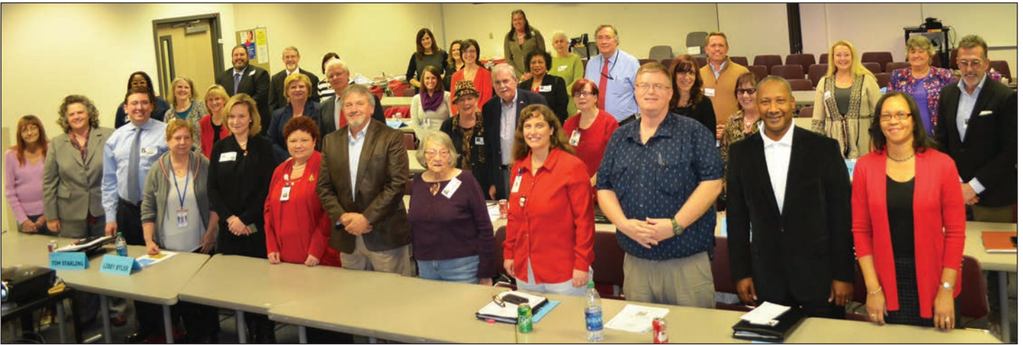
The December 2015 Statewide Planning & Policy Council meeting at Middle Tennessee Mental Health Institute in Nashville.