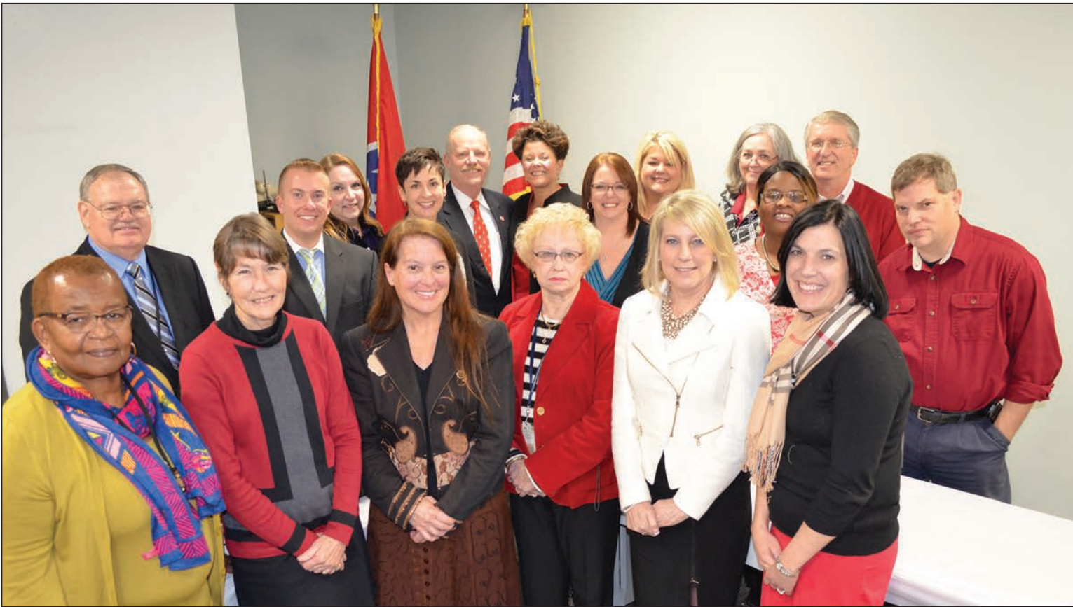
Central Office Staff gathered in December for the annual Service Award celebration. Some of those honored are pictured above. The complete list of honorees, along with years of service, is below.