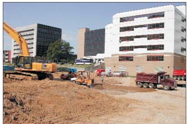
In the days following the groundbreaking, preparation of the site for the new facility is well underway.

In the days following the groundbreaking, preparation of the site for the new facility is well underway. ■