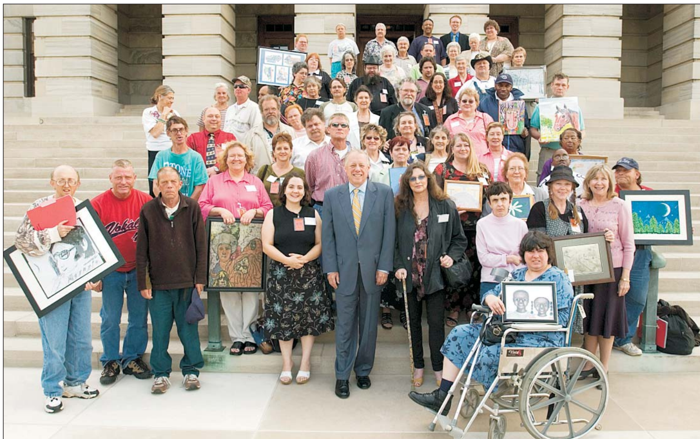
Art for Awareness participants stand on the state Capitol steps with Governor Phil Bredesen for a group photo to commemorate their works displayed during the month of May in the Legislative offices.