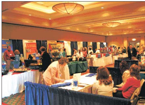
The Yes2Kids sponsor marketplace at the Franklin Marriott.

Next year's eighth annual conference will take place at the Franklin Marriott and Cool Springs Conference Center on February 26-27, 2007. Call 615-279-0058, e-mail yes2kidstn@aol.com or visit www.yes2kidstn.org for more information. ■