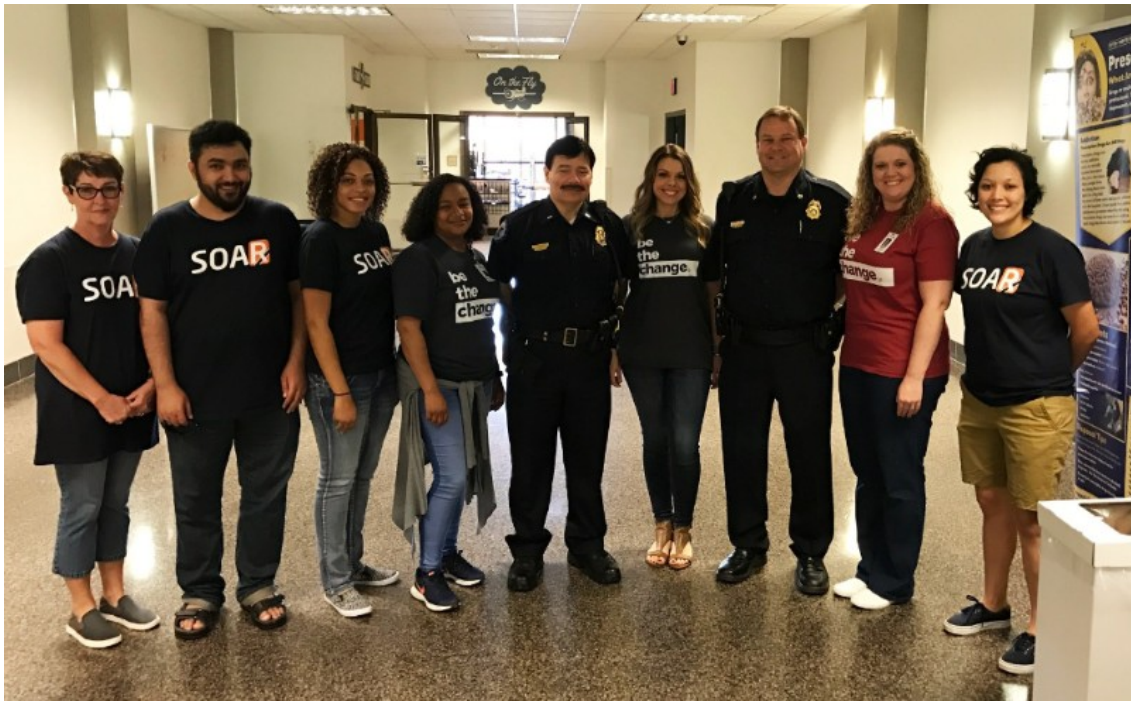
Weakley County Alliance for a Safe and Drug-Free Tennessee