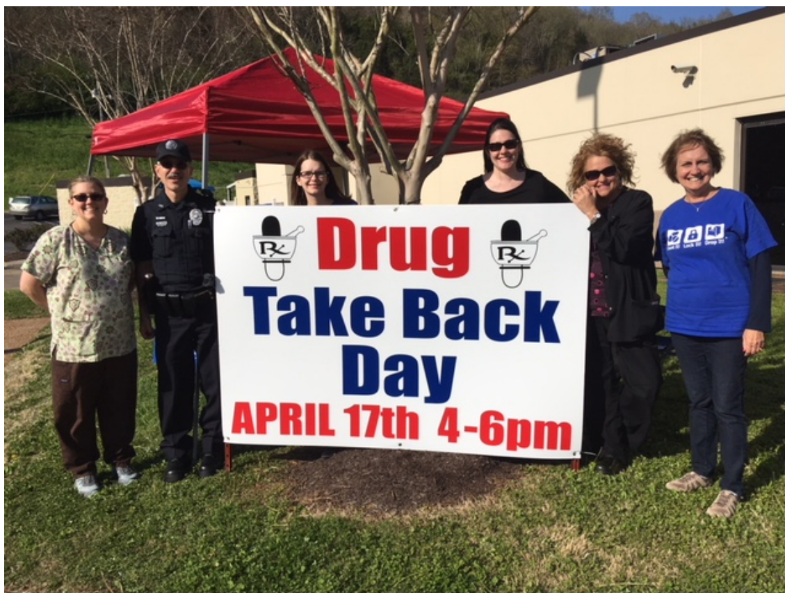
Smith County Drug Prevention

Saturday, April 28 was the latest edition of National Prescription Drug Take Back Day. Many of our community anti-drug coalitions partnered with law enforcement and other local groups to help people safely and securely dispose of expired or unneeded medications. Here are some pictures from take back day.