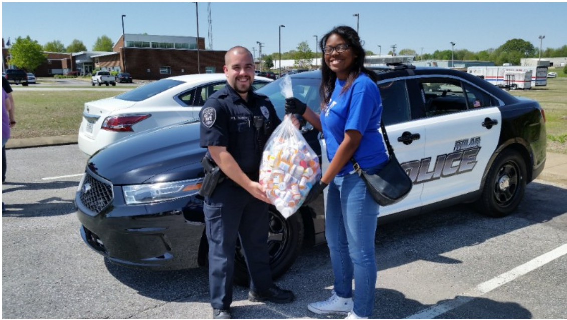
Milan Prevention Coalition