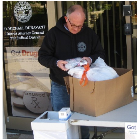
Prevention Alliance of Lauderdale (PAL)