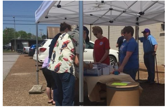
Overton County Anti-Drug Coalition (left) & Lawrence County Anti-Drug Coalition with members of the Health Dept.