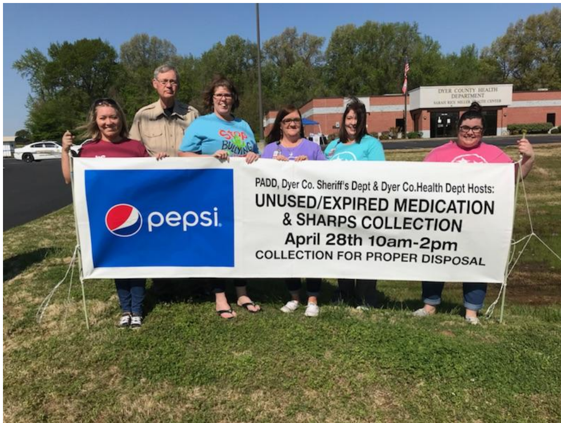
Prevention Alliance of Dyersburg and Dyer County (PADD)