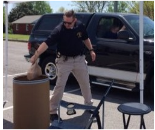
Sullivan County Anti-Drug Coalition