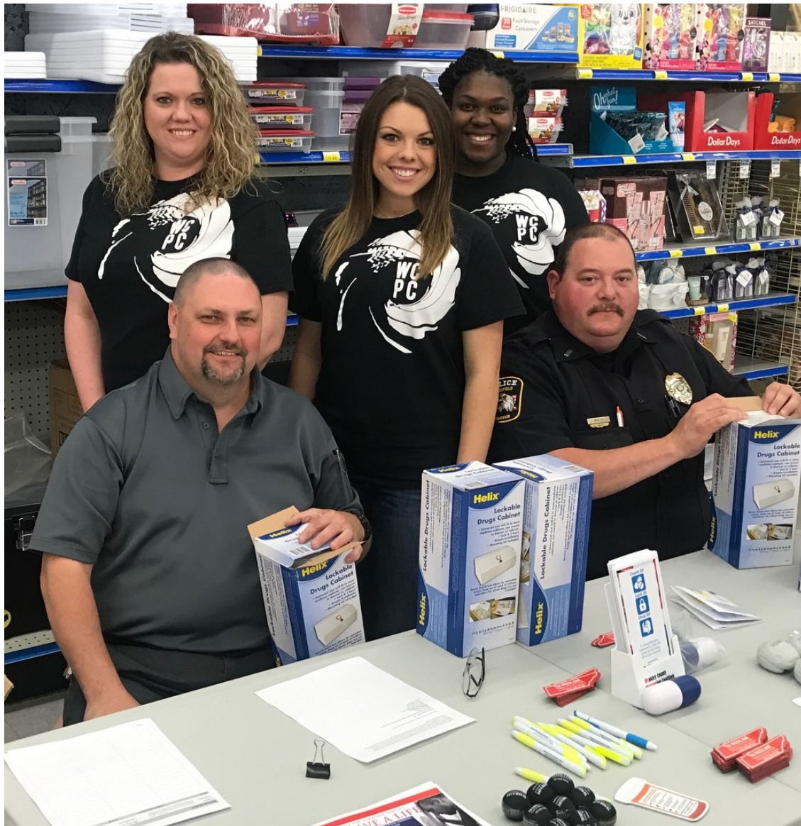
Weakley County Alliance for a Safe and Drug-Free Tennessee (Walgreens)