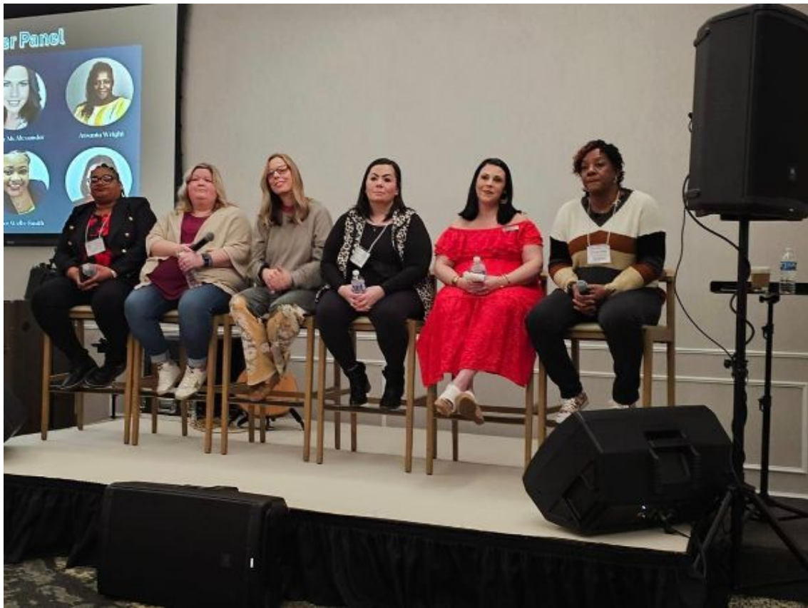
Pictured Above: Saturday's "Power Panel" featured personal testimonies from amazing women who are leaders in Tennessee's peer recovery movement.